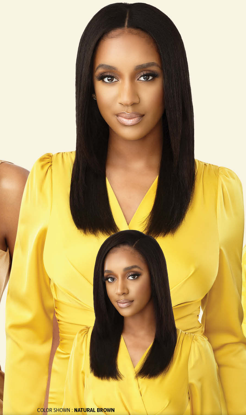
COLOR SHOWN : NATURAL BROWN