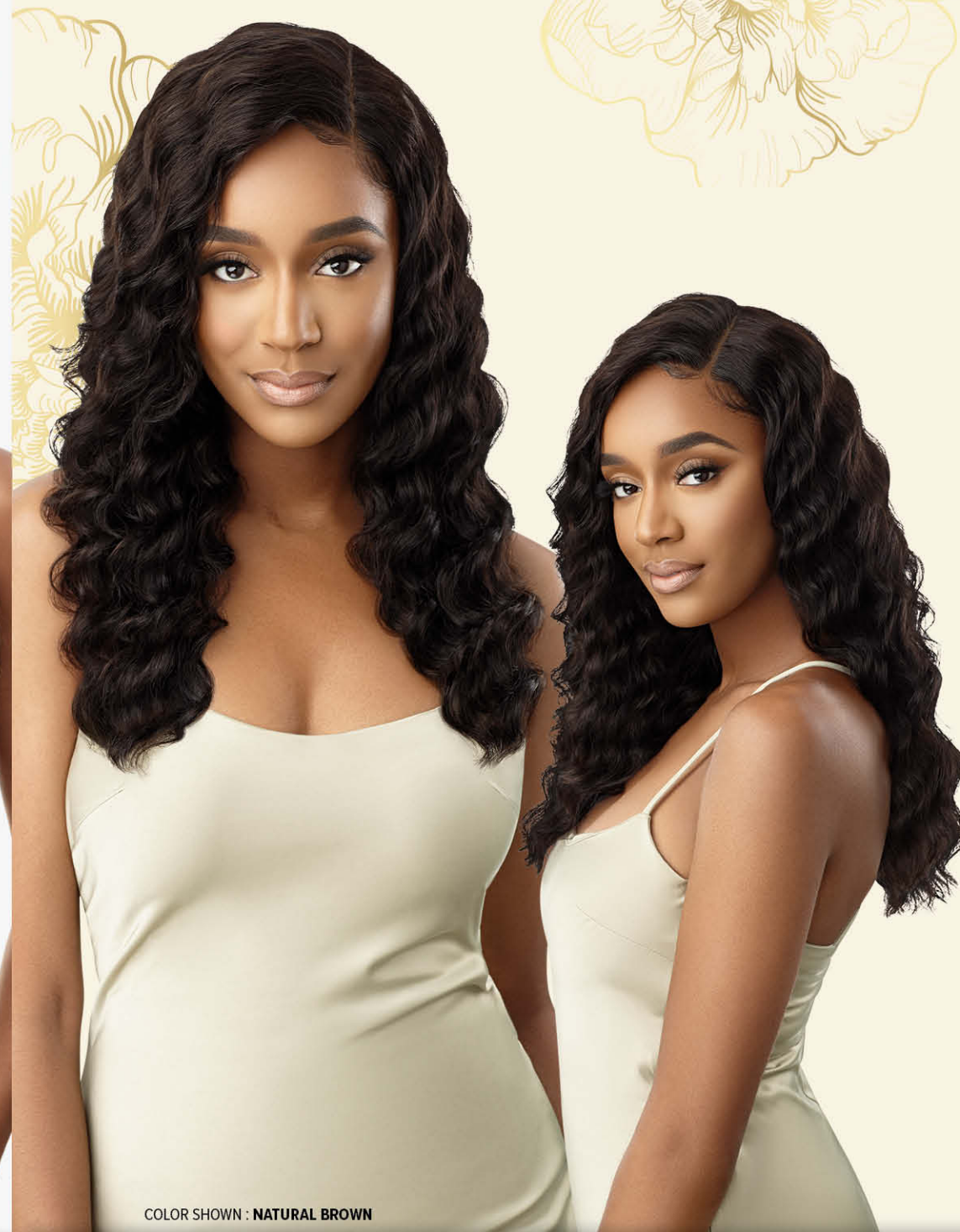
COLOR SHOWN : NATURAL BROWN