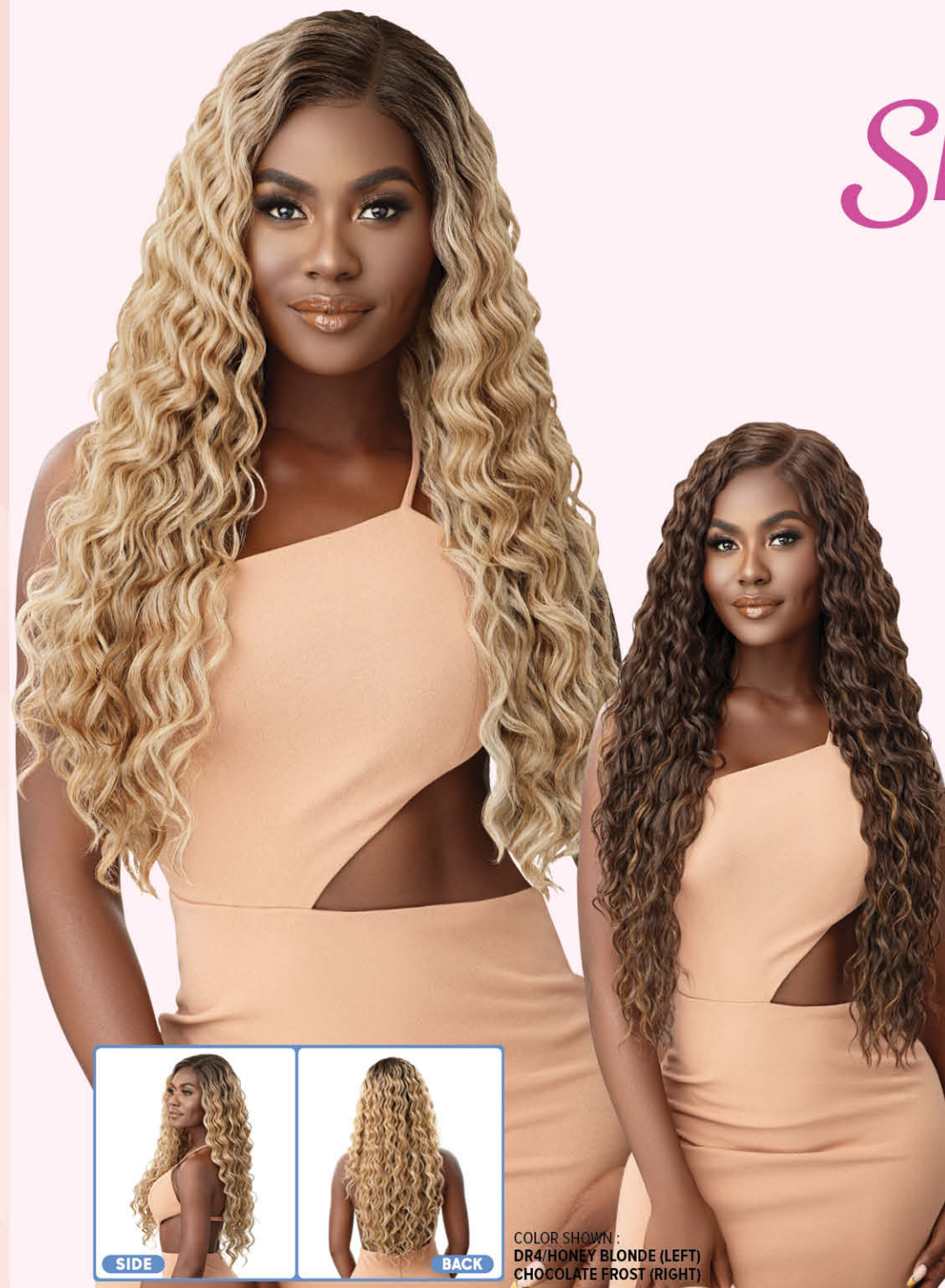
COLOR SHOWN : DR4/HONEY BLONDE (LEFT) CHOCOLATE FROST (RIGHT)