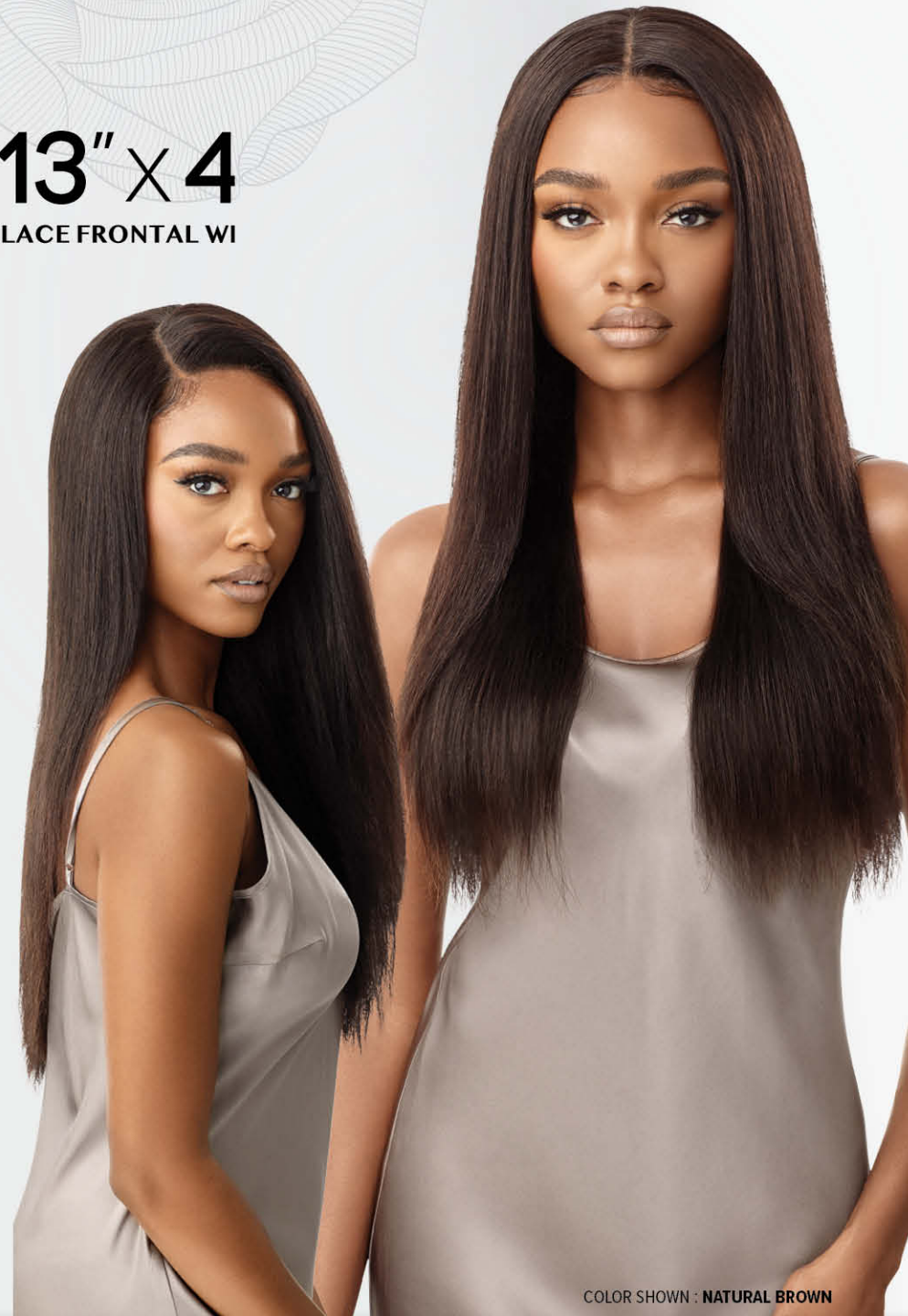
COLOR SHOWN : NATURAL BROWN