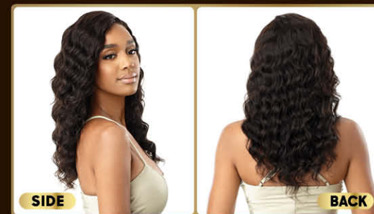
AVAILABLE COLORS : NATURAL BLACK, NATURAL BROWN