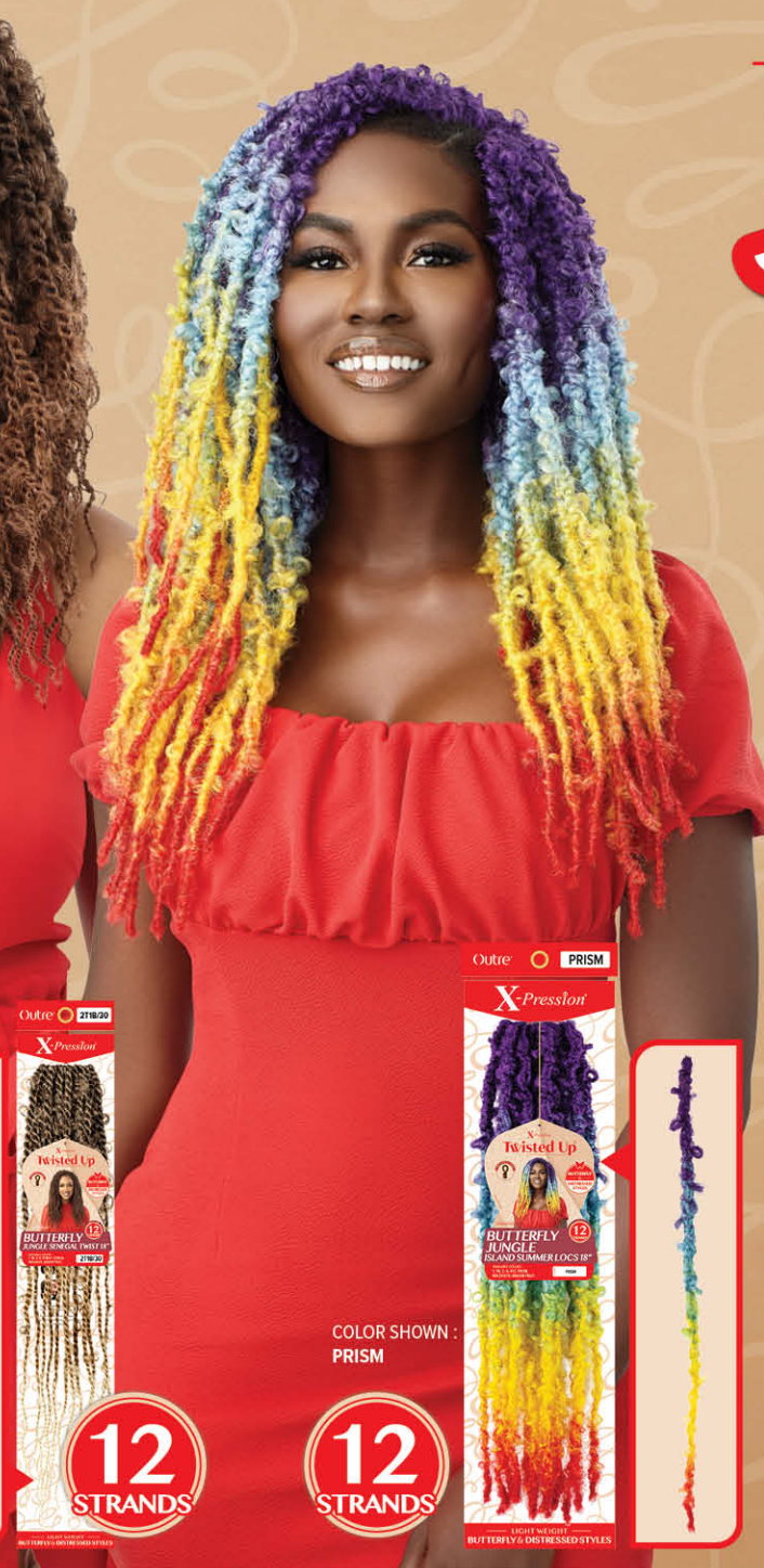
COLOR SHOWN : PRISM