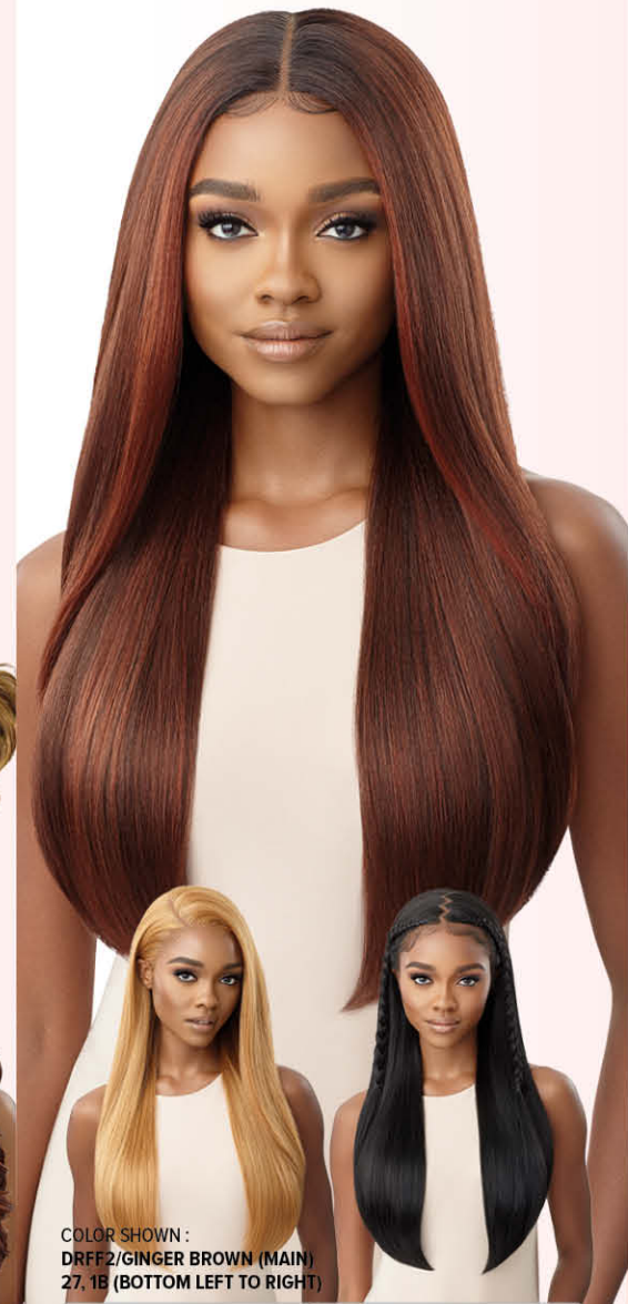
COLOR SHOWN : DRFF2/GINGER BROWN (MAIN) 27, 1B (BOTTOM LEFT TO RIGHT)