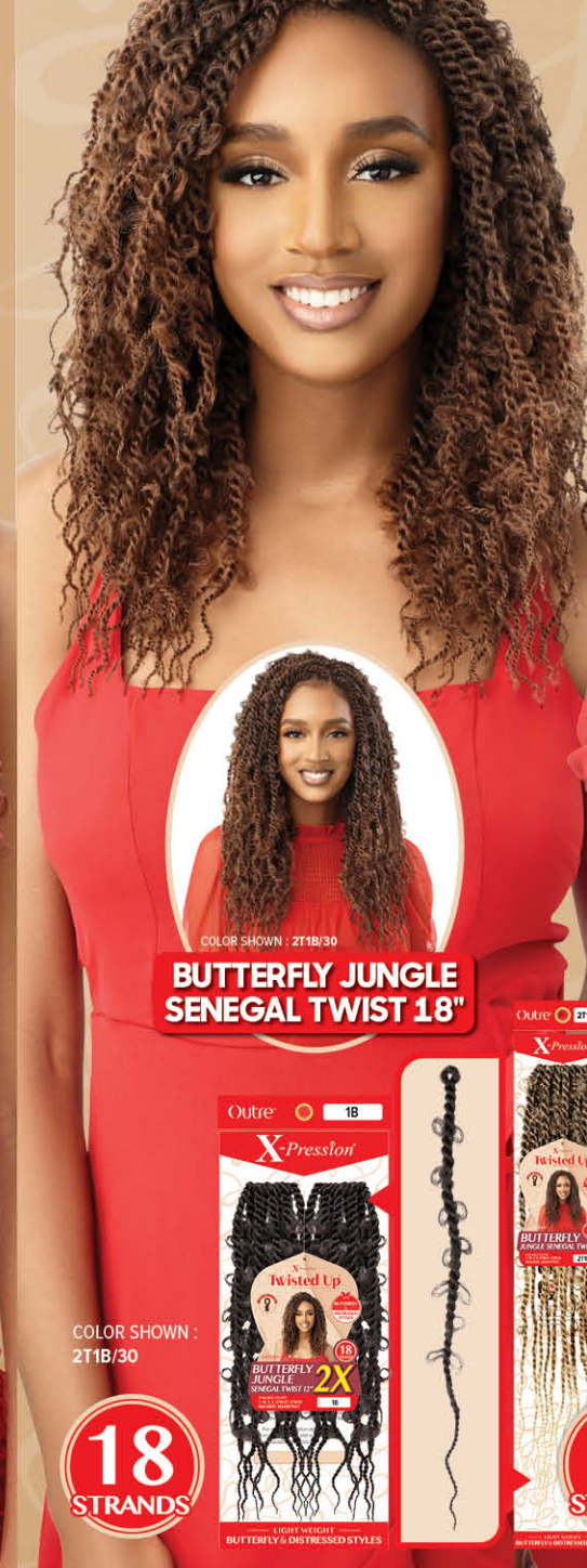
COLOR SHOWN : 2T1B/30