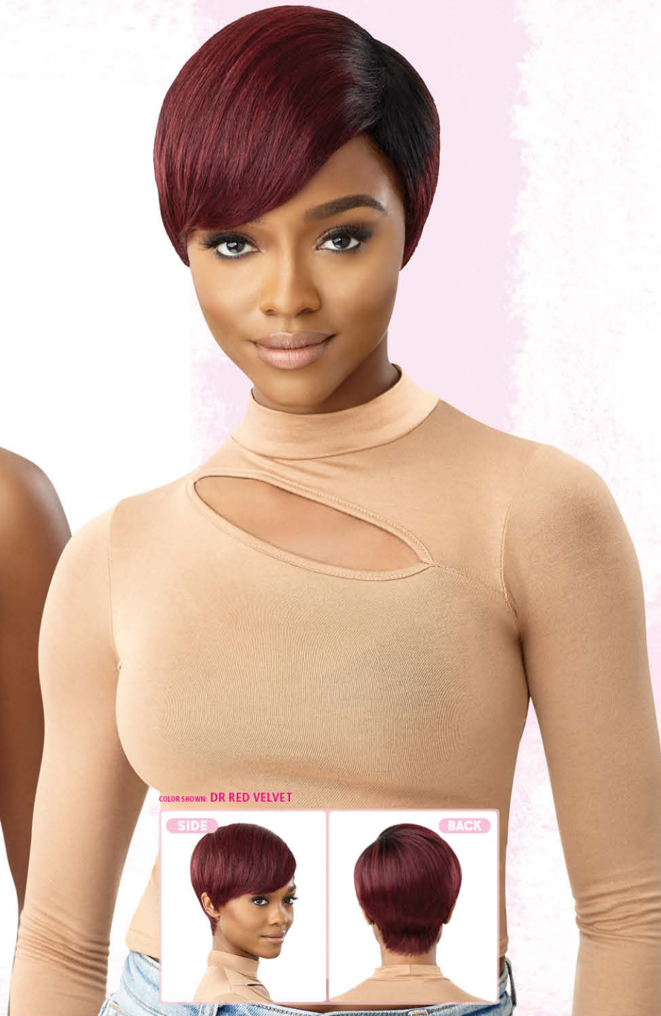
COLOR SHOWN: DR RED VELVET