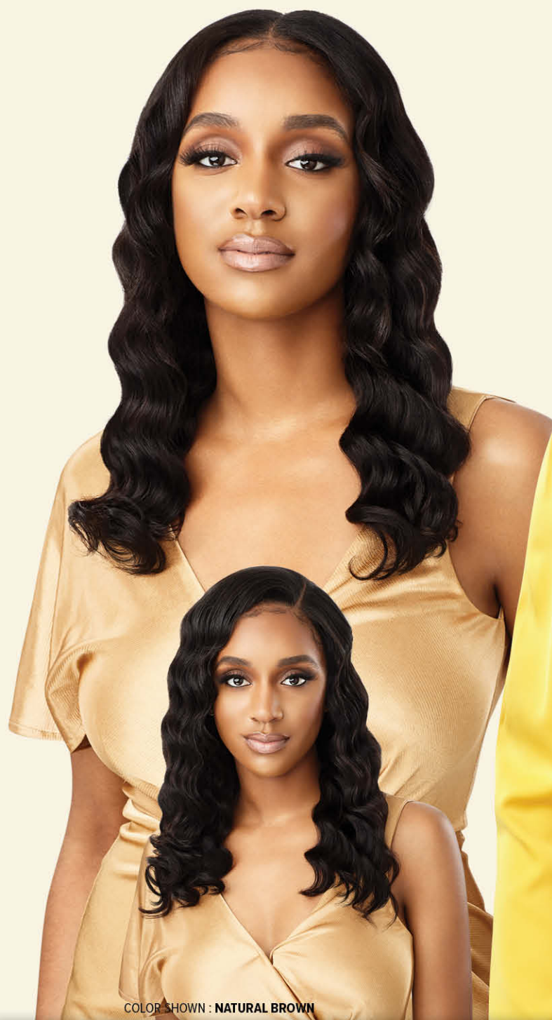
COLOR SHOWN : NATURAL BROWN