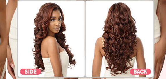
EVERETTE 13" X 6" 26"