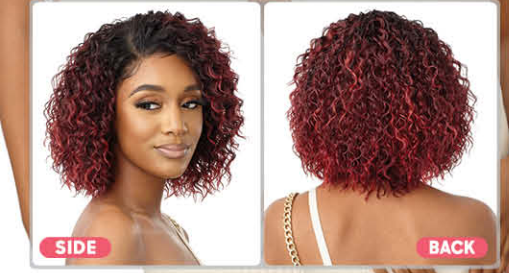
LISSIE 13" X 4" 12"