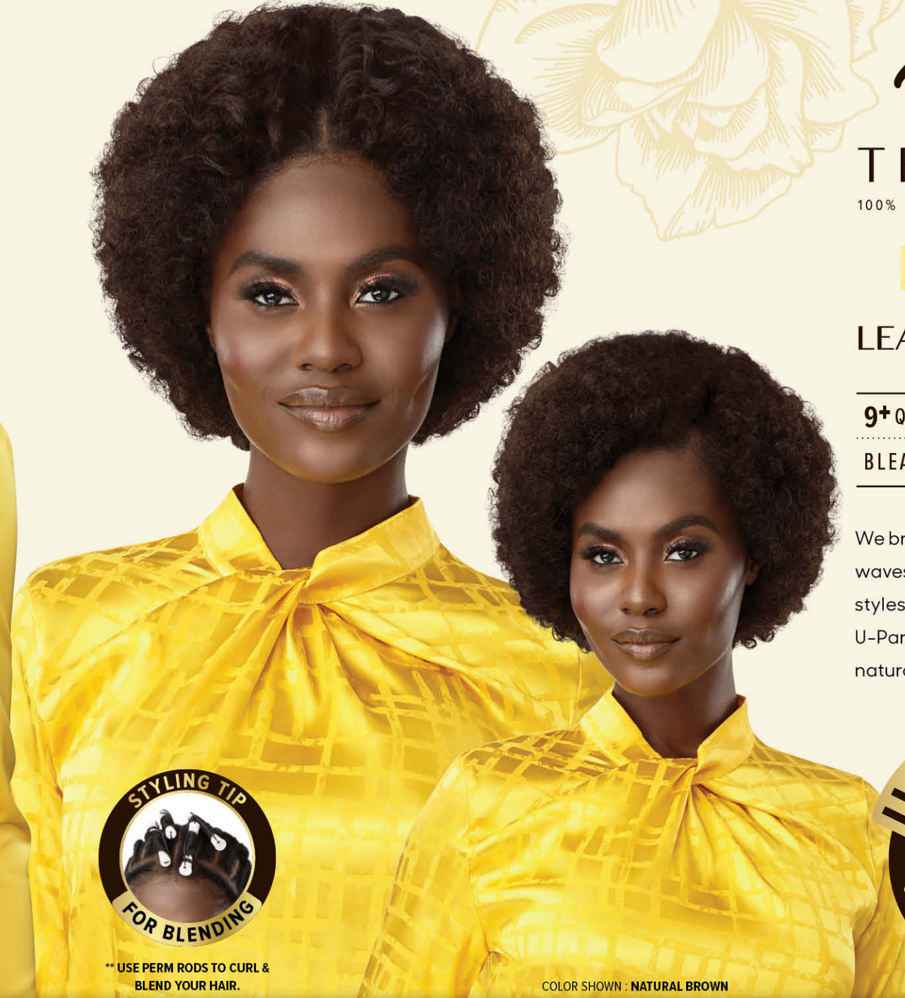
COLOR SHOWN : NATURAL BROWN