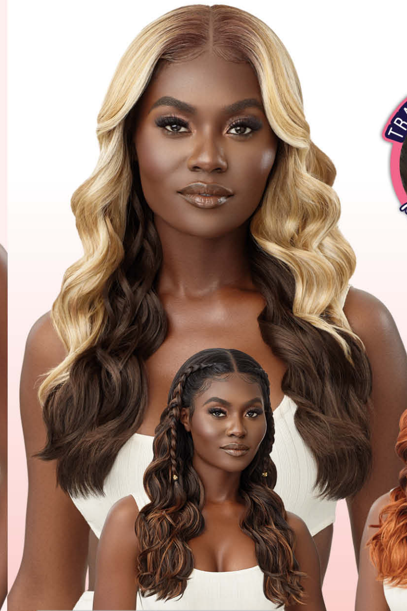
COLOR SHOWN : DRFF6/HONEY OVER CHOCOLATE (MAIN) DRST MAPLE BROWN, 3DRFF CAJUN SPICE (BOTTOM LEFT TO RIGHT)