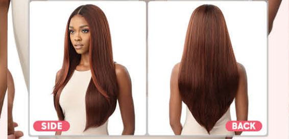
BEXLEY 13" X 6" 28"