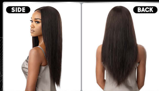
AVAILABLE COLORS : NATURAL BLACK, NATURAL BROWN