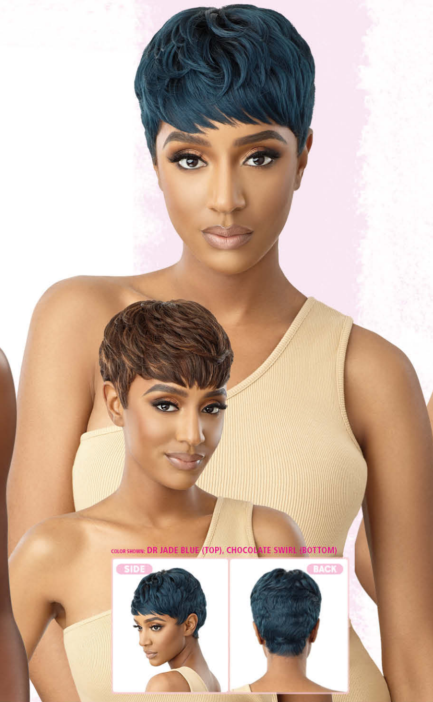
COLOR SHOWN: DR JADE BLUE (TOP), CHOCOLATE SWIRL (BOTTOM)